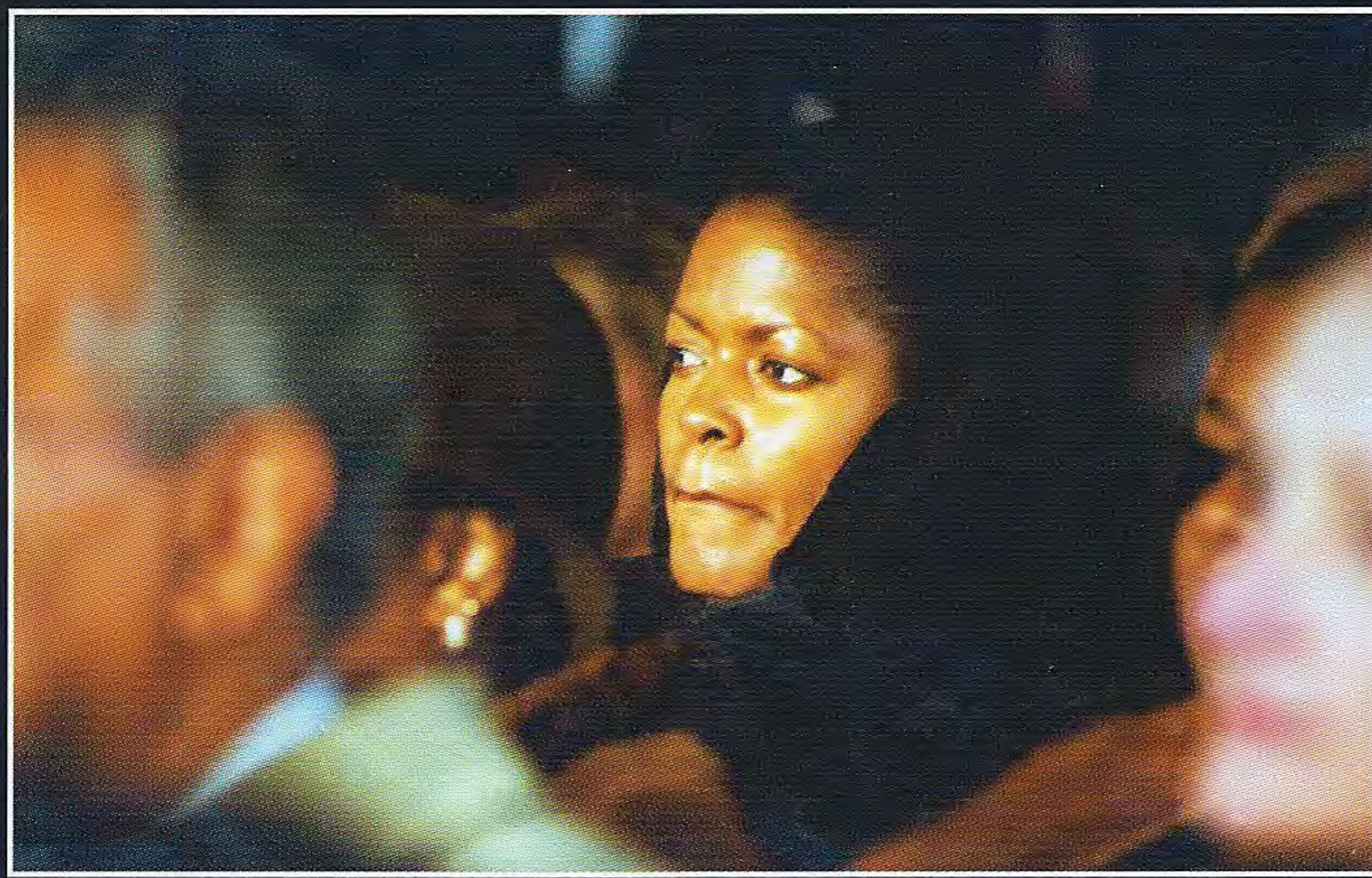
A family member holds back her emotions.